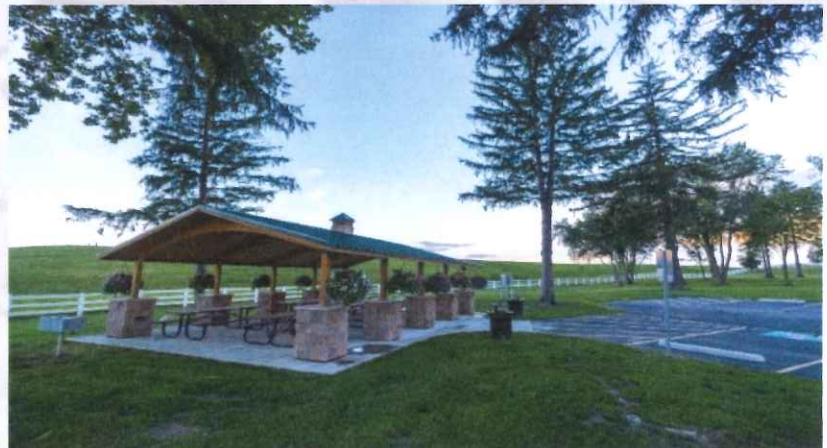
Pettibone Rd. Park 29810 Pettibone Rd