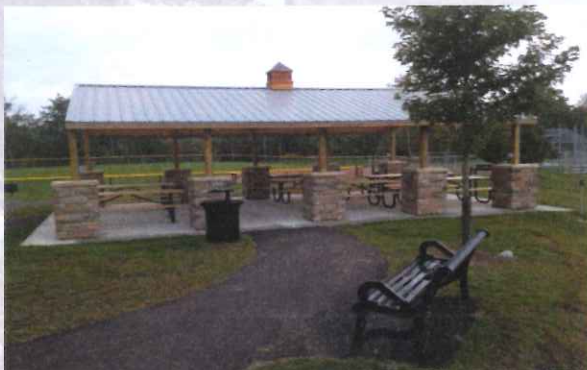
Donald N. Payne Recreation Complex 7380 Austin Powder Drive

The pavilion must be restored to its original condition after your event has been held. You are responsible for clean-up. Damage to the facility will not be tolerated and alcoholic beverages are strictly prohibited within the Village Park. Bathrooms must be left clean, and all trash placed in Village receptacles. The Village reserves the right to assess an additional fee if the pavilion is damaged due to intentional neglect. No parking on grass. Parking is limited to parking lots only. To reserve either pavilion or for more information, please call Lori at Village at 440-232-8788.