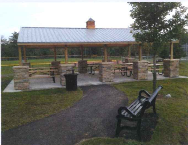
Donald N. Payne Recreation Complex 7380 Austin Powder Drive

The pavilion must be restored to its original condition after your event has been held. You are responsible for clean-up. Damage to the facility will not be tolerated and alcoholic beverages are strictly prohibited within the Village Park. Bathrooms must be left clean and all trash placed in Village receptacles. The Village reserves the right to assess an additional fee if the pavilion is damaged due to intentional neglect. No Parking on Grass. Parking is limited to parking lots only. To reserve either pavilion or for more information please call Lori at Village at 440-232-8788.