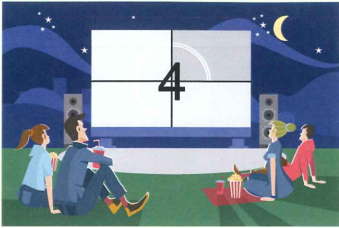
Movie TBD Proudly Sponsored by NOPEC

We look forward to seeing you at the FREE family-friendly movie in the park this summer. On Saturday August 27th, grab your blankets and chairs and bring the whole family for a fun relaxing evening under the stars. A movie will be shown on a giant inflatable screen at the Donald Norman Payne Recreation Complex. The movie title is TBD. Come early to grab a great spot, enjoy the company of your friends, family and neighbors, and a few surprises for the kids. Movie will begin at dusk! Concessions will be available for purchase.