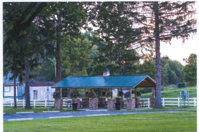
Pettibone Road Park 29810 Pettibone Road