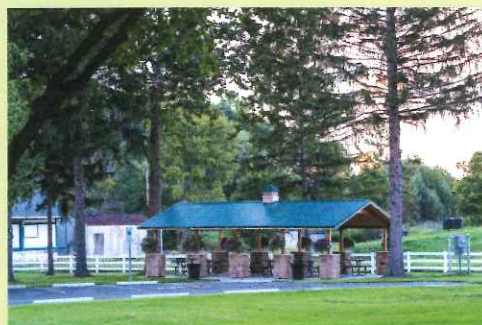
pavilion at the Pettibone Rd. Park

Two pavilions are available for residents to reserve. One is at the Donald N. Payne Recreation Complex and the other is at the Pettibone Road Park near the Train Depot. Amenities at both sites have picnic tables, charcoal grills, and electricity. The pavilion at Pettibone Road Park does not have restrooms available at this time. There is a $100 refundable deposit due at the time of reserving the pavilion. Contact Lori at Village Hall to check available dates for the pavilions. 440-232-8788 or email: lpepera@glenwillow-oh.gov