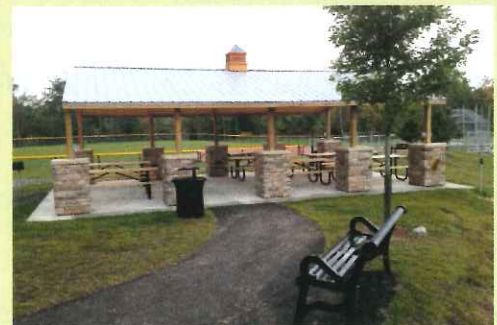
pavilion at the Donald N. Payne Recreation Complex