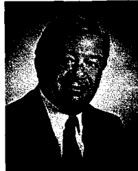
Mayor Donald N. Payne

The Village of Glenwillow is experiencing shorter summer days and another annual ritual as well; the return to school. The beginning of school is a time when children are at increased risk of injuries from bicycle, school bus, and motor vehicles crashes. Indeed, today this includes skateboards, scooters and rollerblades. Many more children are on the sidewalks and roads each morning and afternoon. So, as schools open their doors on August 25th, PLEASE follow these traffic safety practices: