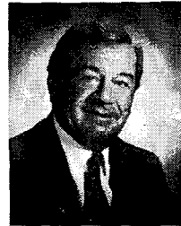
Mayor Donald N. Payne