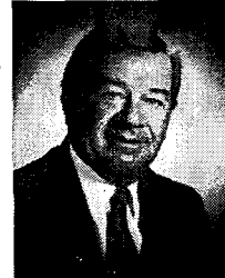
Mayor Donald N. Payne